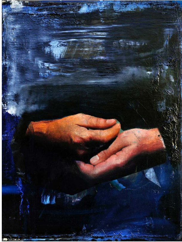
Robert Cleworth, memento mori - two hands , 2016, oil on wood panel, 50 x 38cm