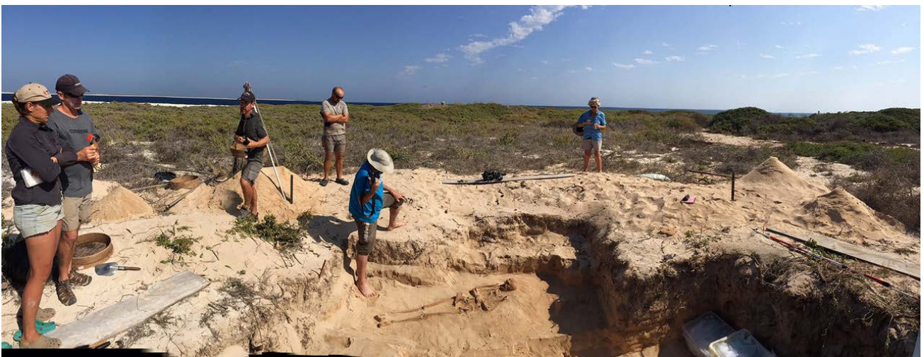
Discovery of SK16 on Beacon Island, 2015, Photographer: Jeremy Green