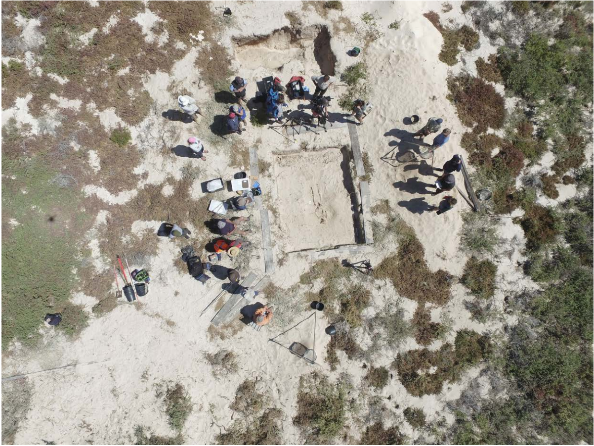
Batavia Dig Beacon Island, 2015, Photographer: Jeremy Green