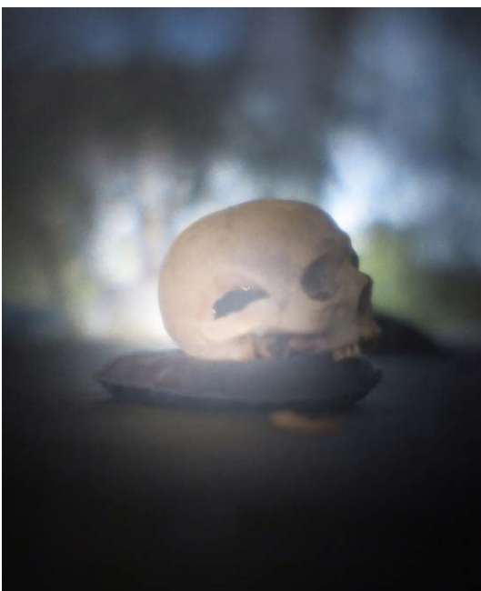
Paul Uhlmann, Batavia skull (camera obscura I) , 2015, photo-print on aluminum, 15 x 12cm